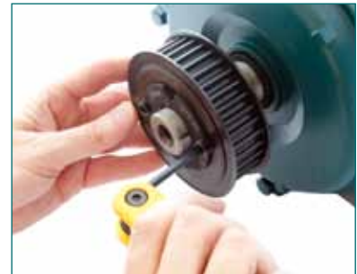
TIGHTEN SCREWS ALTERNATELY