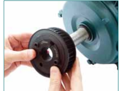
INSERT SCREWS AND LOCATE ON SHAFT