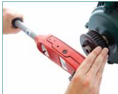
TIGHTEN SCREWS TO THE CORRECT TORQUE SETTING