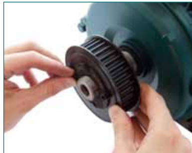
TIGHTEN SCREWS FINGER TIGHT